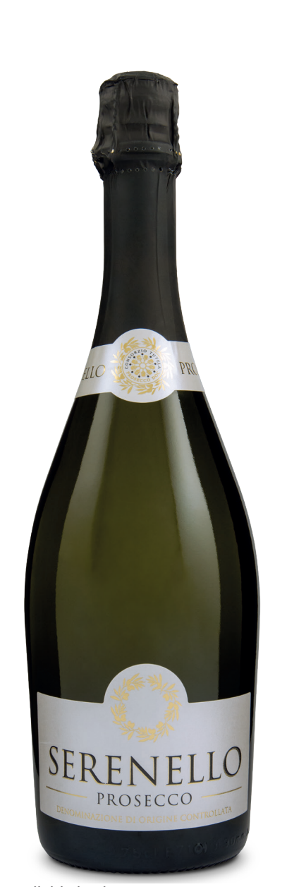
Available in size: 0,20 L - 0,75 L - 1,5 L